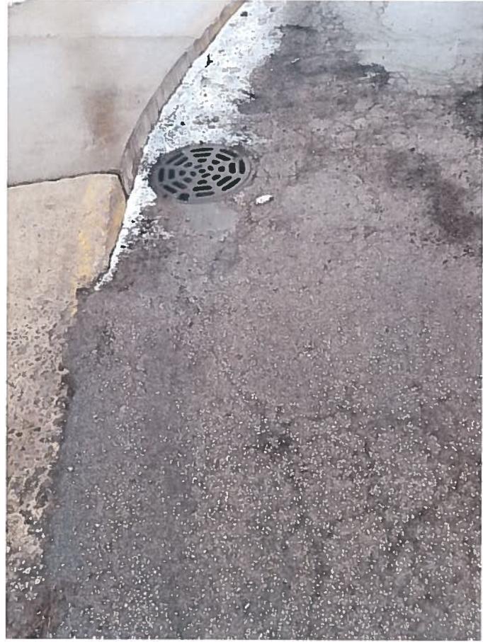
Sidewalk Drain Exact area will be marked in orange on March 2